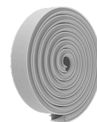
SILICONE DIFFUSER INCLUDED